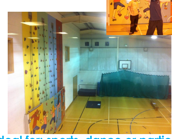
Ideal for: sports, dance or parties, and resident / other group meetings